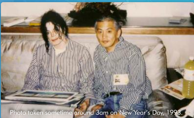
Photo taken sometime around 3am on New Year's Day, 1993.